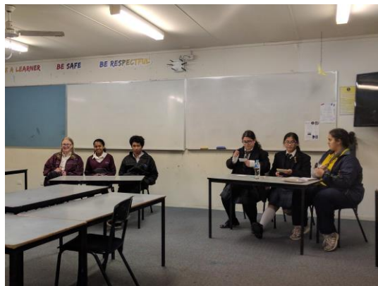
Manor Lakes College up against Mt St Joseph's Girls College.